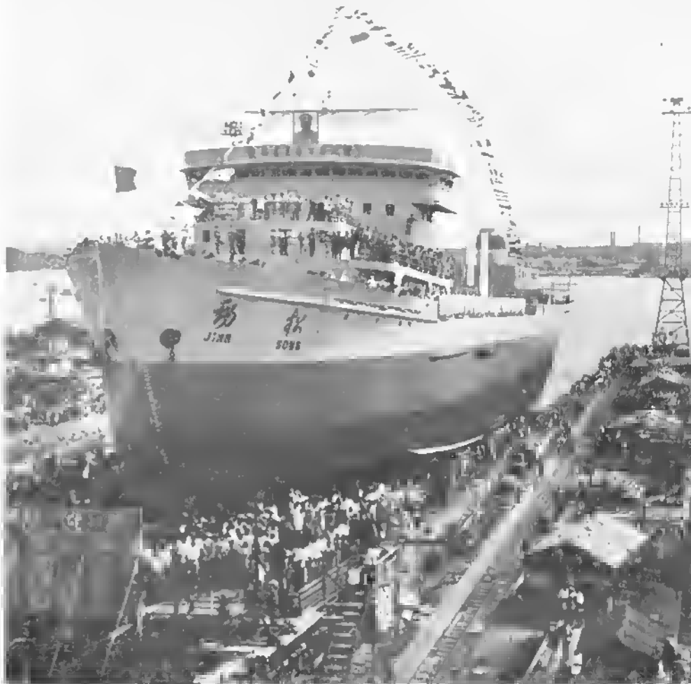
The Jingsong is launched.

The system's advanced equipment includes an advanced world standard automatic electronic apparatus to record the subscriber's and receiver's numbers, the date, length of call and calculates the charge. Proved on the Peking-